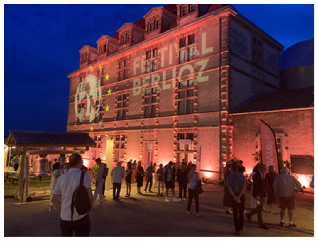
The Chateau illuminated for the Festival

I strongly encourage Society Members who have not yet visited the Festival to think seriously about doing so while the standards remain so remarkably high. All good things must come to an end, of course; but the Festival has had a truly remarkable run, and shows no sign of running out of steam for a while yet.